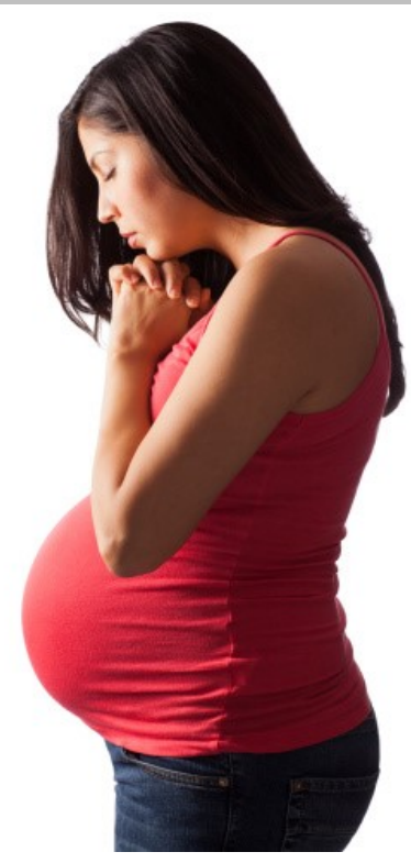
Prenatal Services Services Include