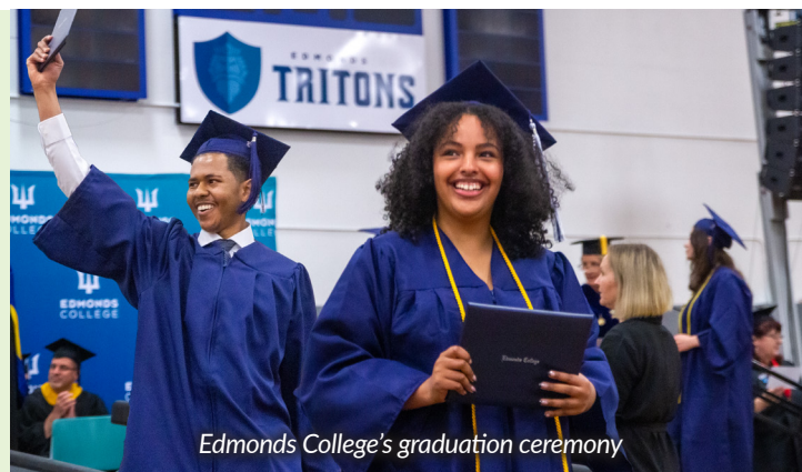
Edmonds College's graduation ceremony